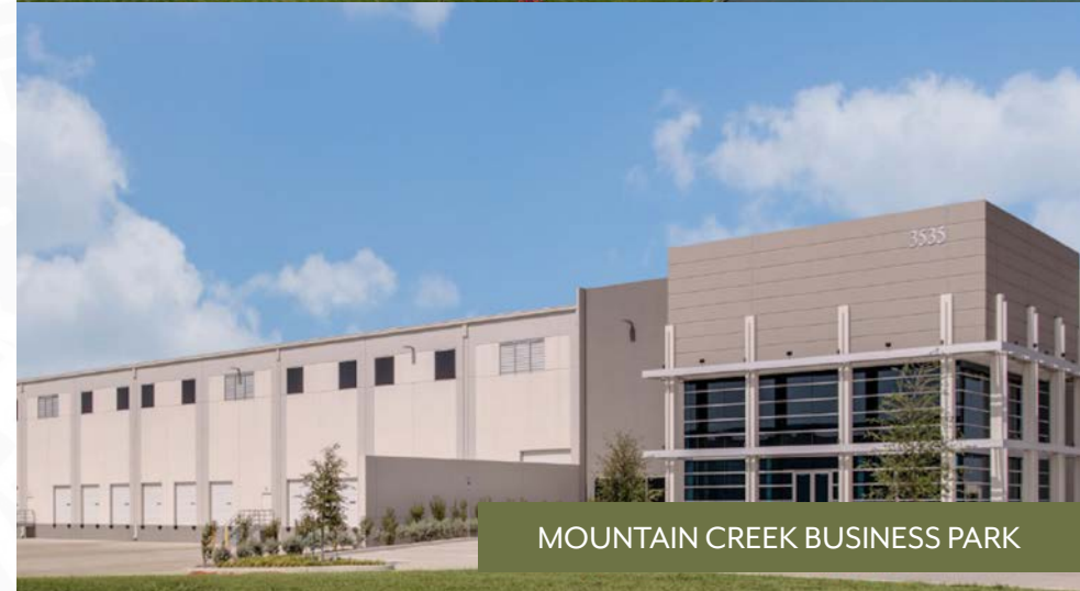
MOUNTAIN CREEK BUSINESS PARK