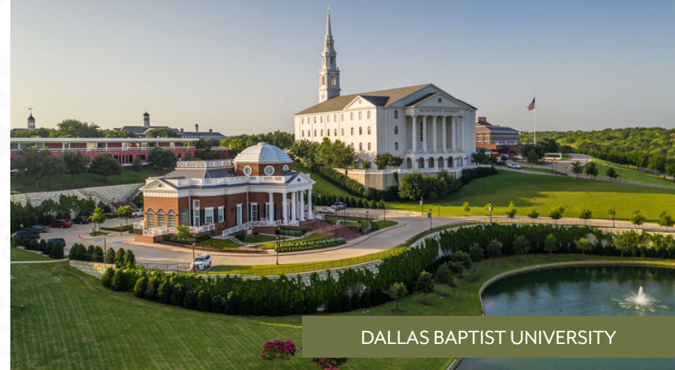
DALLAS BAPTIST UNIVERSITY

Mountain View College was established in 1970. It offers students various degrees associated to aviation, such as (1) Professional Pilot, (2) Aircraft Dispatcher, and (3) Airport Management. The total enrollment of students is 11,619 with an average yearly cost of $19,154 before aid. It is a very unique institution offering aviation programs to the southwestern community of Dallas.