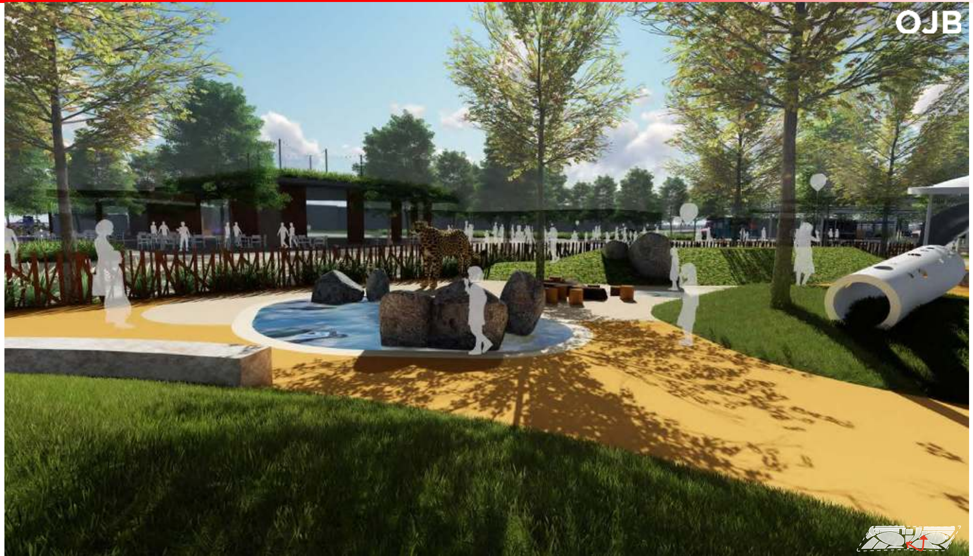
SOUTHERN GATEWAY DECK PARK