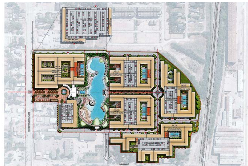
SITE PLAN: SOHO MEGATEL HOMES LAGOON CHARETTE

Megatel 2nd phase of development will include about 2,100 apartments. Construction is expected to start this year. The masterplan development includes a crystal lagoon, and Megatel's site borders the subject property. It's the latest in a wave of redevelopment in the area, which began with the construction of the Margaret Hunt Hill Bridge last decade.