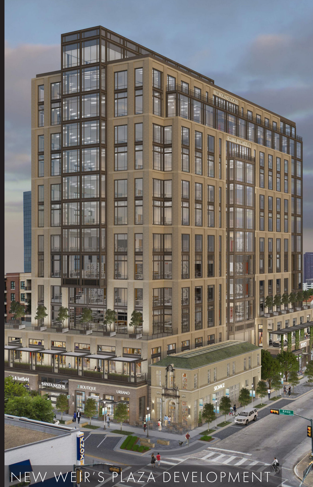
NEW WEIR'S PLAZA DEVELOPMENT

Apple Taverna YETI Dallas Toulouse Lululemon Little Katana Restoration Hardware Knox Bistro Pottery Barn Chuy's Crate + Barrel Trader Joe's Weir's Furniture The Skellig Love Sac Henderson Tap House