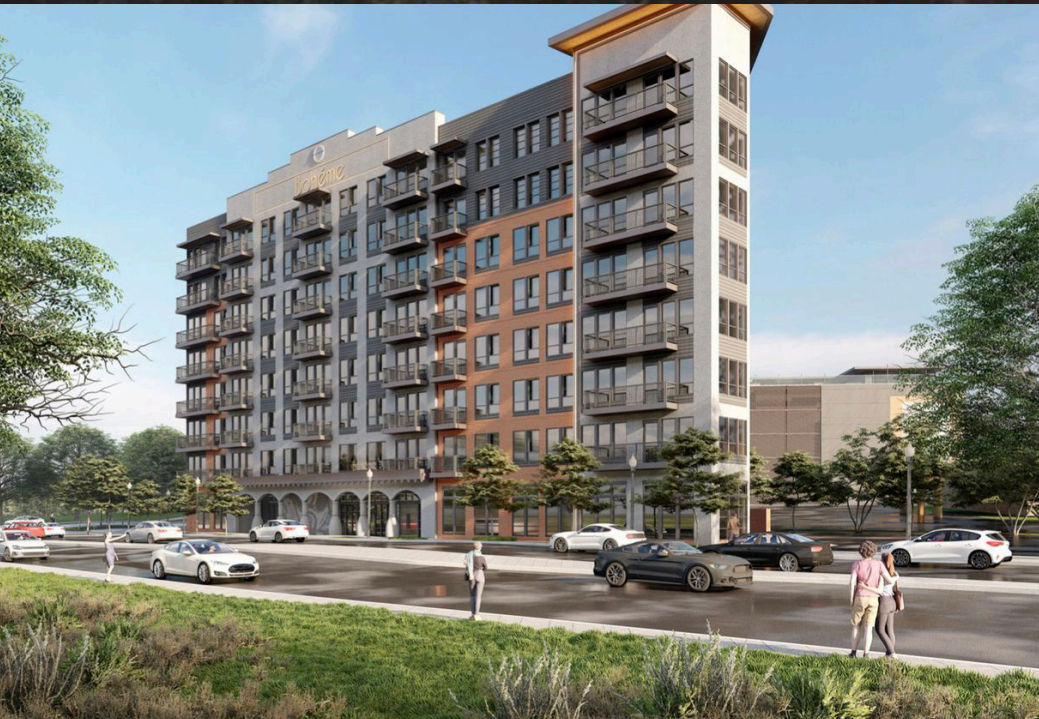
KAIROI DEVELOPMENT - BOHEME