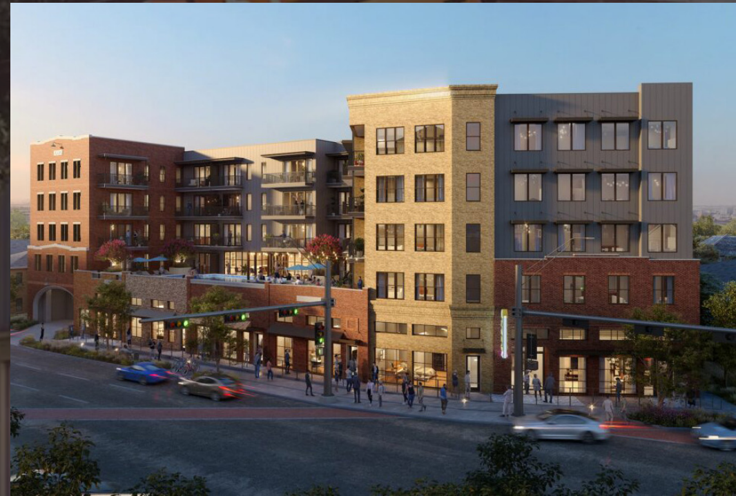
LARKSPUR DEVELOPMENT - ZANG FLATS