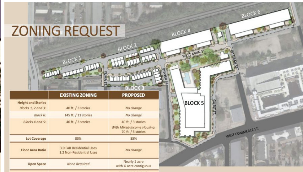
The Park on West Main