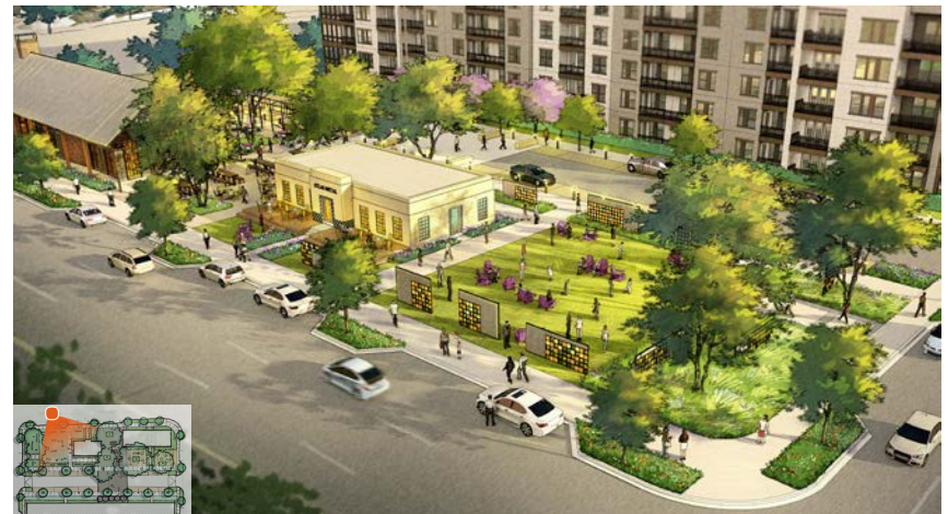
818 Singleton perspective views TBG

The Atlas Metal Works factory at 818 Singleton Blvd. dates to the 1920s and includes almost 6 acres at the corner of Sylvan Avenue. The property is one of the largest development sites along Singleton Boulevard, which is seeing a wave of construction of apartments, restaurants, and retail buildings. The Atlas Metal Works property is just west of the popular Trinity Groves restaurant campus and is next door to the $400 million Trinity Green apartment and home community. Dallas-based apartment builder Lantower Living has received approval from the City Council to rezone the property for a new rental community and retail space. Two five-story apartment buildings with more than 400 units and a garage would occupy the southern side of the block, which is now taken up by a complex of metal-manufacturing buildings. The developer agreed to repurpose the art deco-style office building facing Singleton and set aside areas for open space.