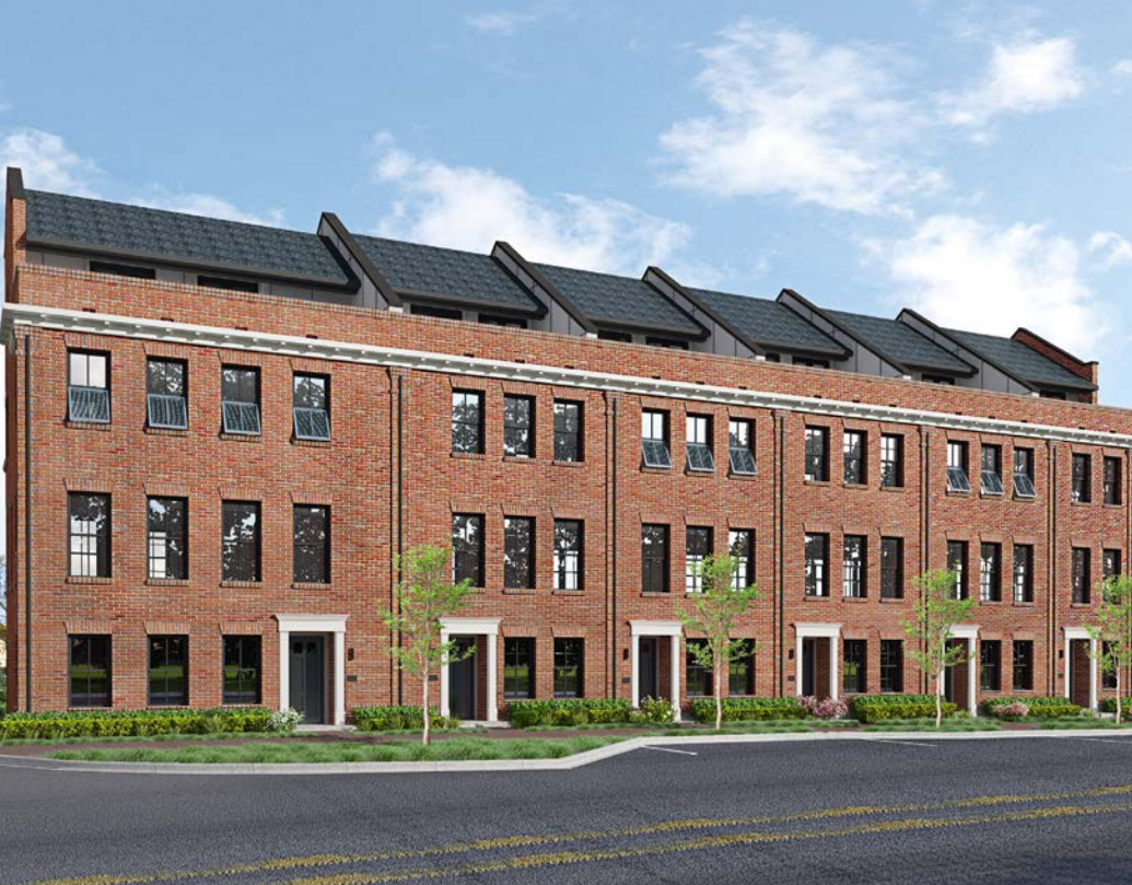
STREET VIEW FROM ZANG BLVD.