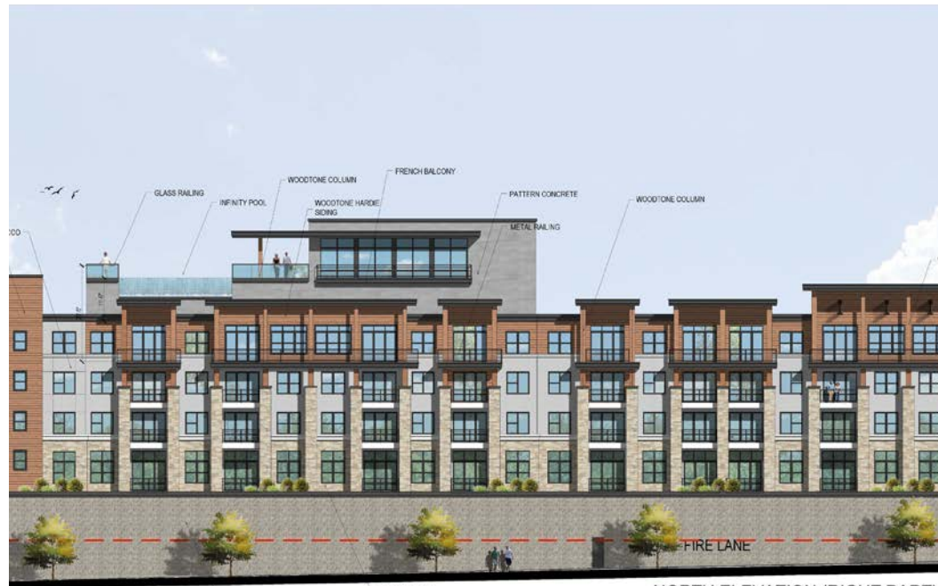
NORTH ELEVATION ( RIGHT PART)

Any projections used are speculative in nature and do not represent the current or future performance of the site and therefore should not be relied upon. We make no guarantee or warranty regarding the information contained in this flyer. You and your advisors should perform a detailed, independent investigation of the property to determine whether it meets your satisfaction and the Seller expressly disclaims any representation or warranty with respect to the accuracy of the Submission Items, and Buyer acknowledges that it is relying on its own investigations to determine the accuracy of the Submission Items. Davidson & Bogel Real Estate, LLC, 2024