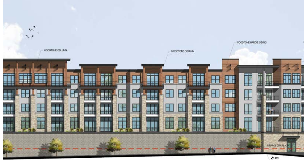
NORTH ELEVATION ( ENTRY PART)