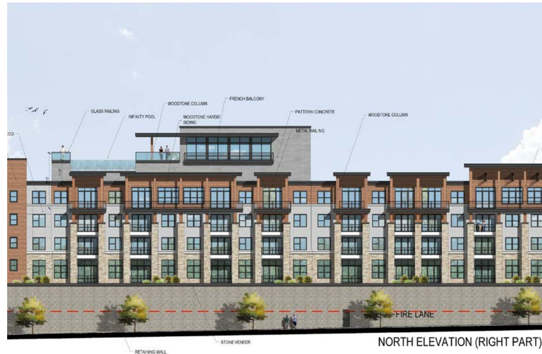
NORTH ELEVATION ( POOL DECK PART)