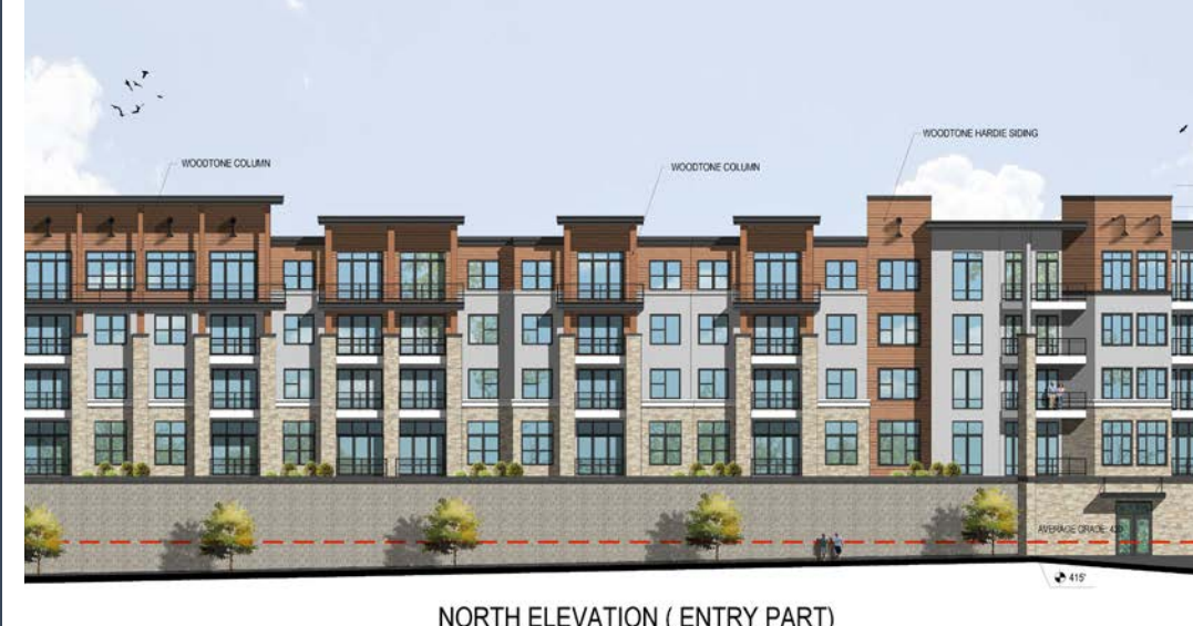
NORTH ELEVATION (ENTRY PART)