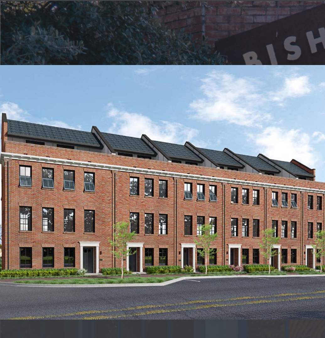
STREET VIEW FROM ZANG BLVD.

.2 MILES NORTH OF SUBJECT SITE CONSTRUCTION ESTIMATED TO COMMENCE Q4 2023