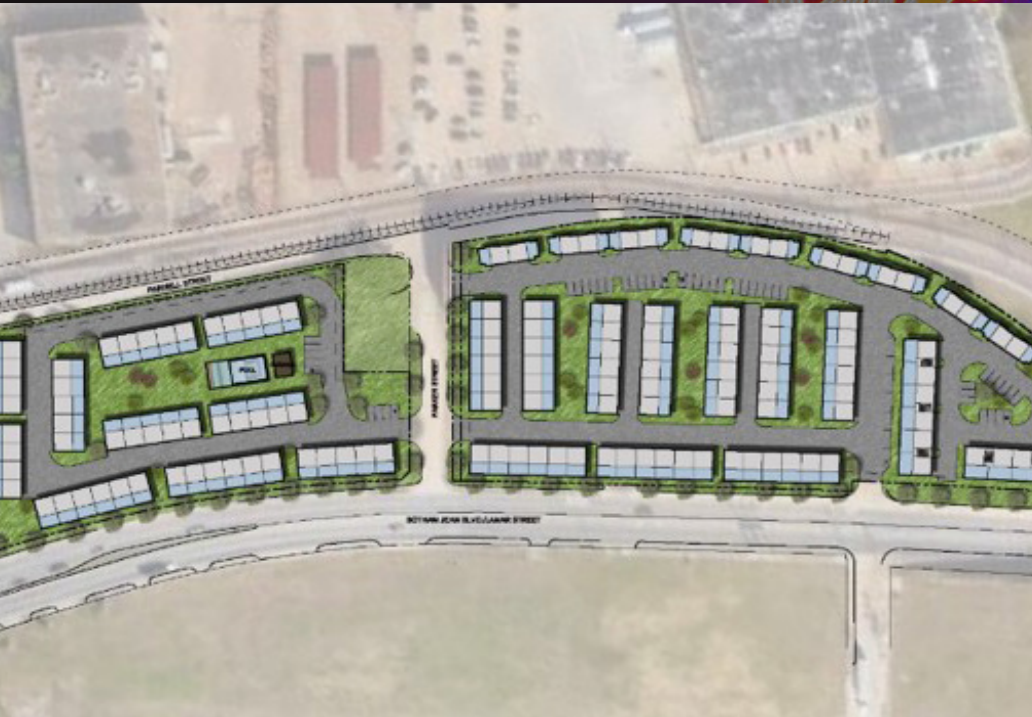
LARKSPUR'S PLANNED BUILD TO RENT DEVELOPMENT DIRECTLY SOUTH EAST OF SUBJECT PROPERTY