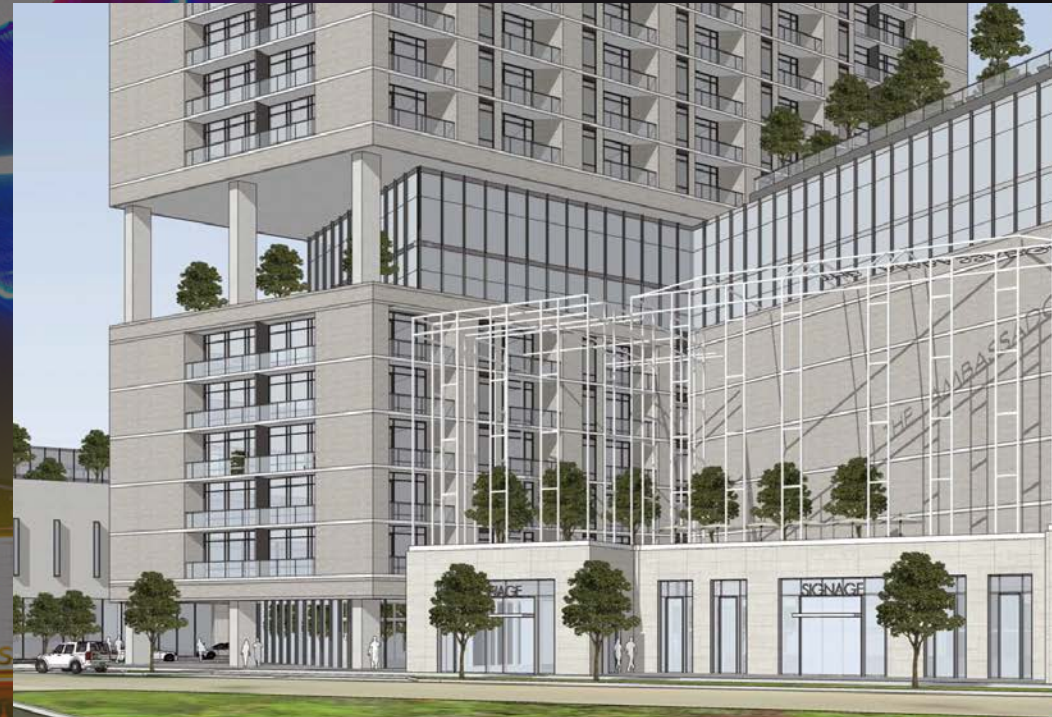
OHT MULTIFAMILY DEVELOPMENT AT THE FORMER AMBASSADOR SITE ON 1300 S. ERVAY .45 MILES NORTH OF SUBJECT SITE. NEW RENDERINGS COMING SOON