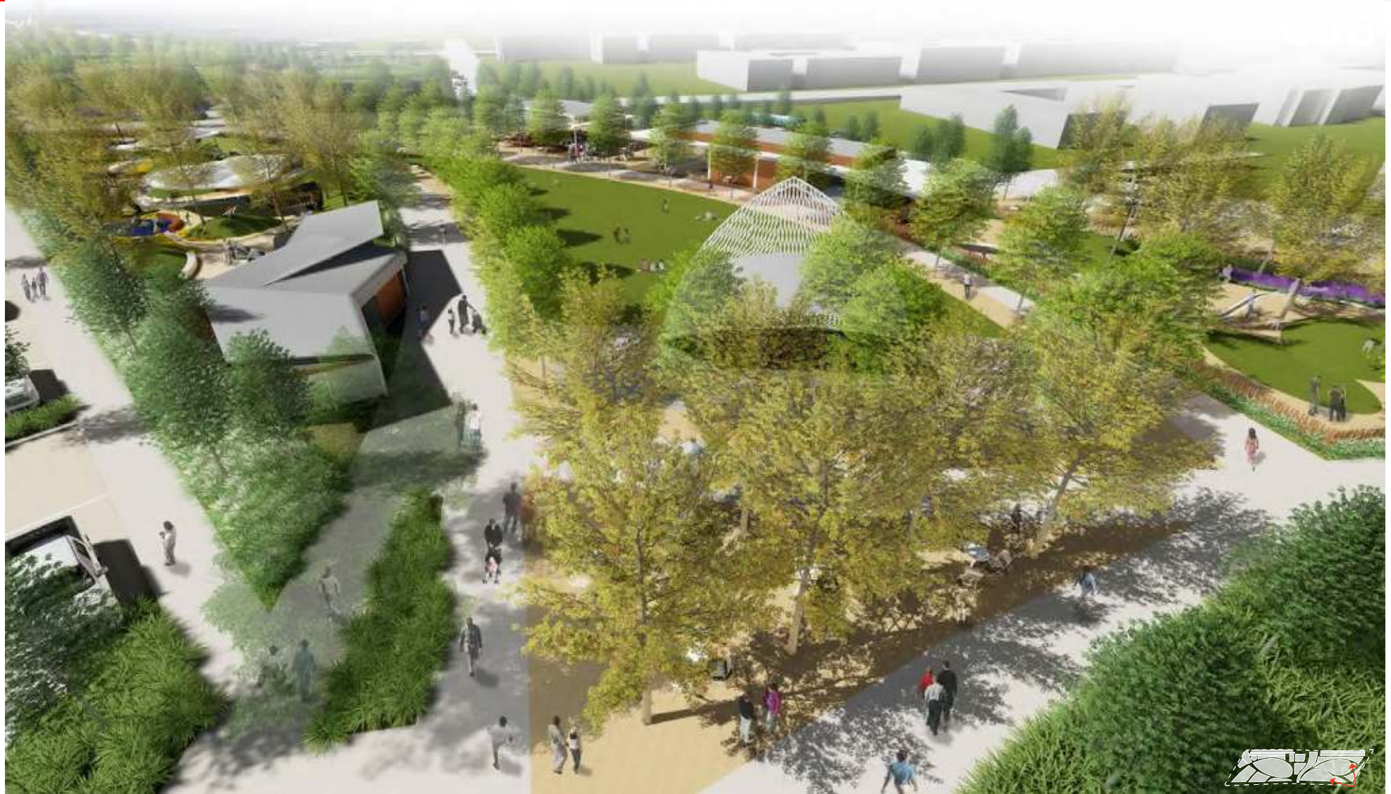
SOUTHERN GATEWAY DECK PARK