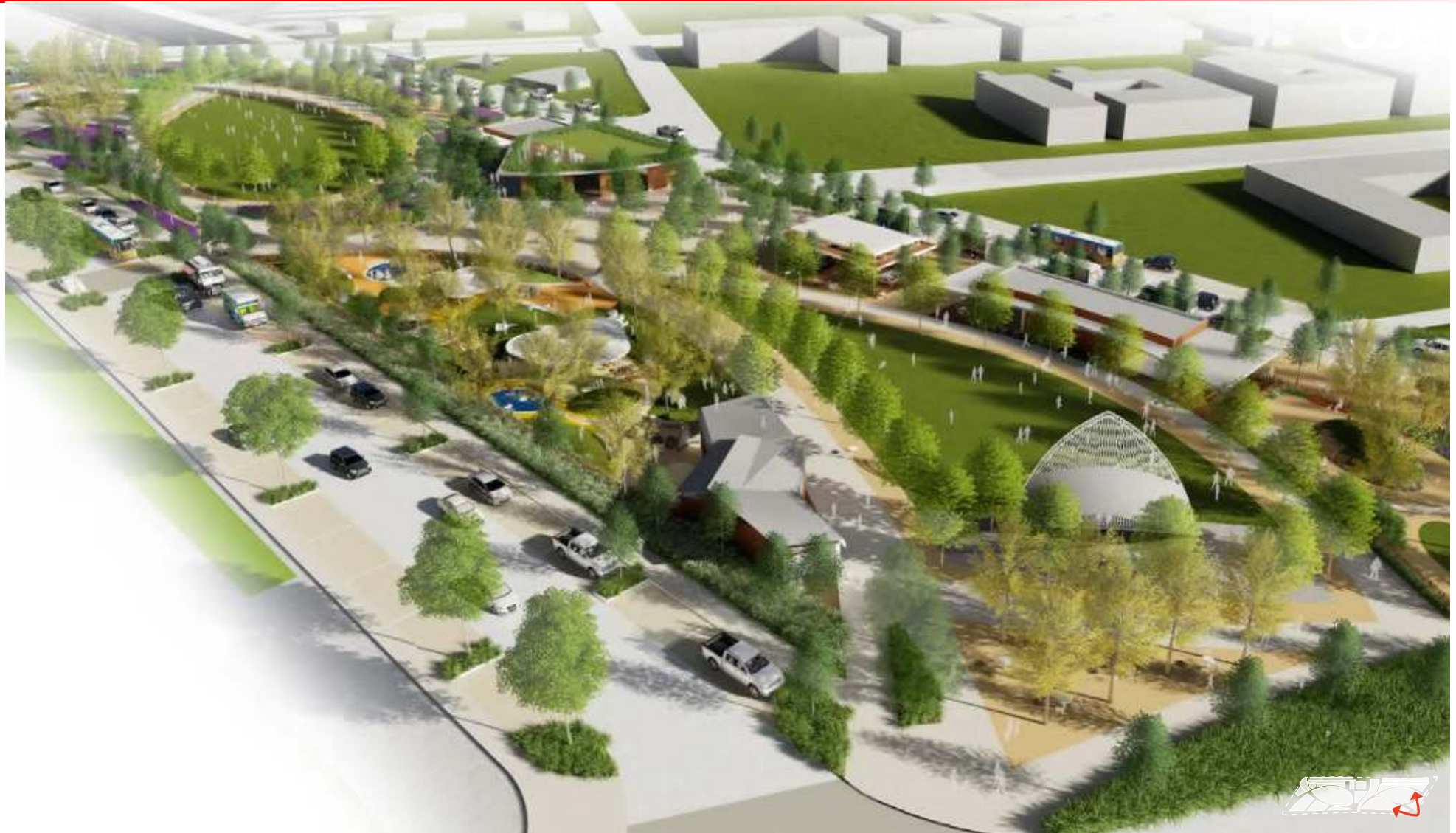
SOUTHERN GATEWAY DECK PARK