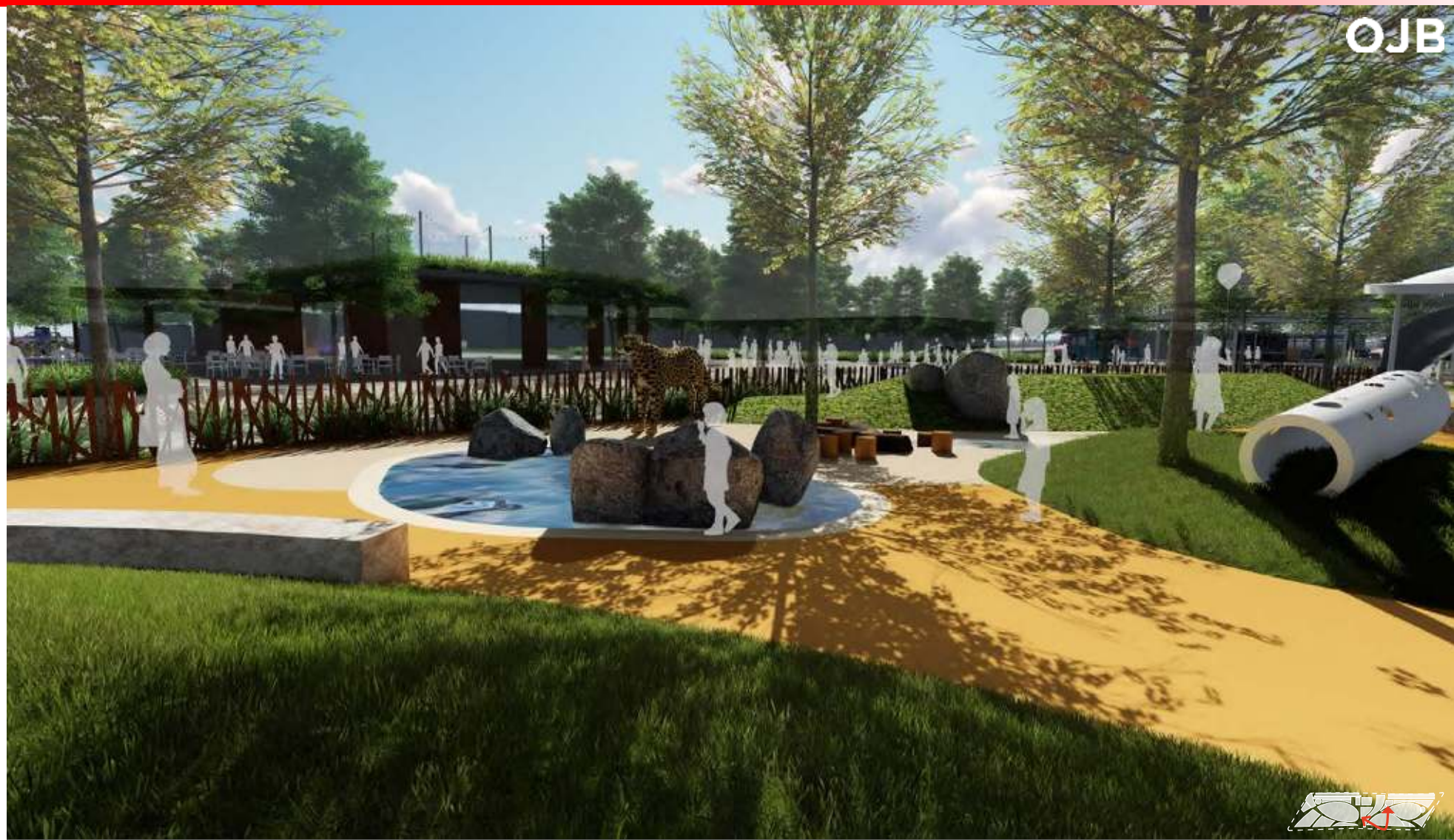
SOUTHERN GATEWAY DECK PARK