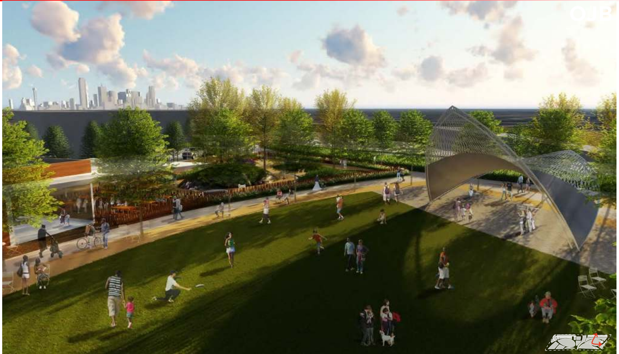
SOUTHERN GATEWAY DECK PARK