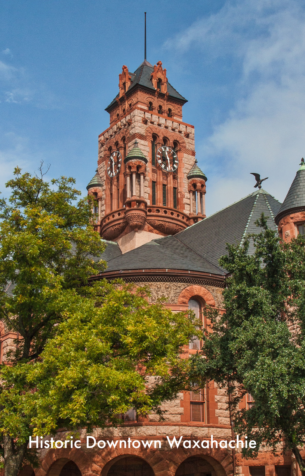
Historic Downtown Waxahachie