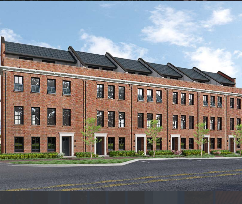
STREET VIEW FROM ZANG BLVD.

DIRECTLY ACROSS THE STREET, EAST OF SUBJECT SITE CONSTRUCTION ESTIMATED TO COMMENCE Q4 2023